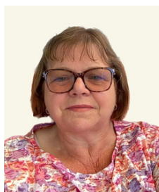
Jill Wardle Public Governor 01/07/2023