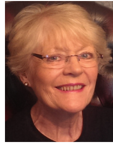
Judith Webster Public Governor 01/07/2023