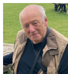
David Coombs Public Governor 01/07/2024