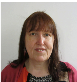
Jacqui McNulty Public Governor 01/07/2024