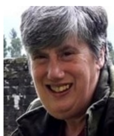
Pamela Coombs Public Governor 01/07/2023