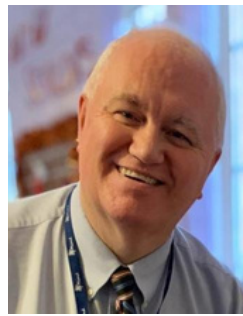
Gary Emerson Public Governor 01/07/2023