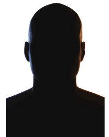
Voluntary sector North Yorkshire & York vacant position