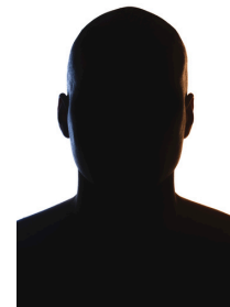
Voluntary sector Co Durham & Tees Valley vacant position