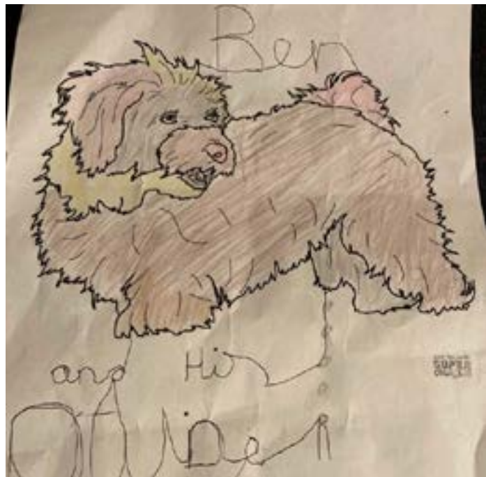
A picture of Ben the therapy dog - coloured in by a patient who chats to Ben during hospital visits.

"I would really encourage people to come forward and do pet therapy. You, and your dogs, can do so much good for other people – and it's really enjoyable too."