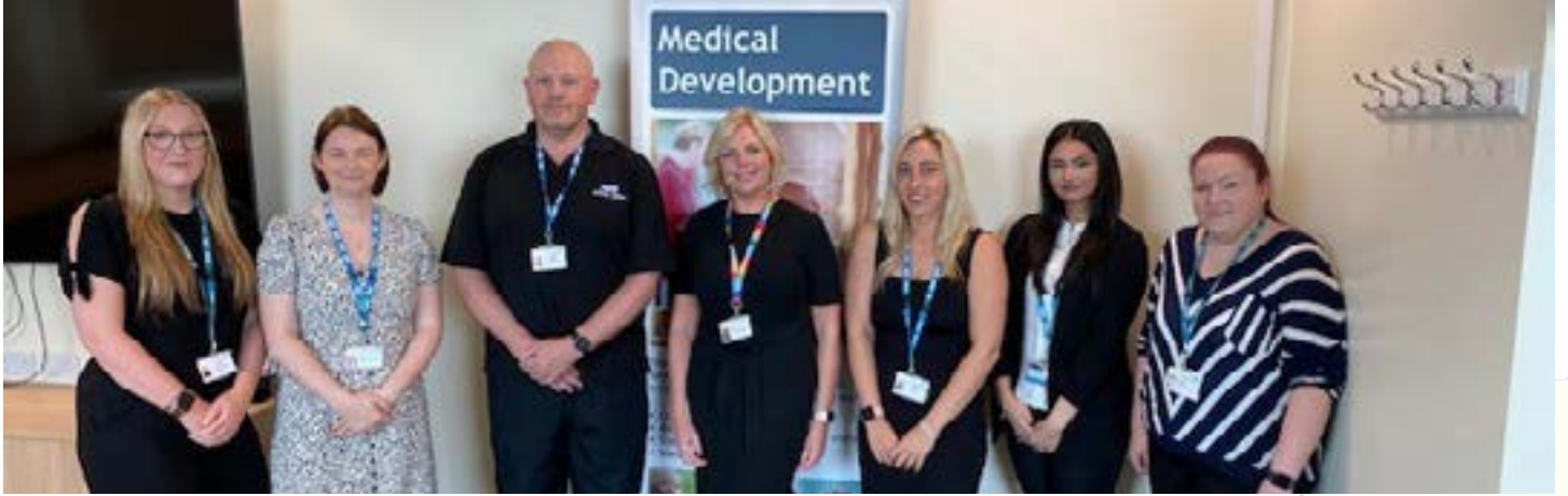
Our northern undergraduate medical education team working with student doctors.