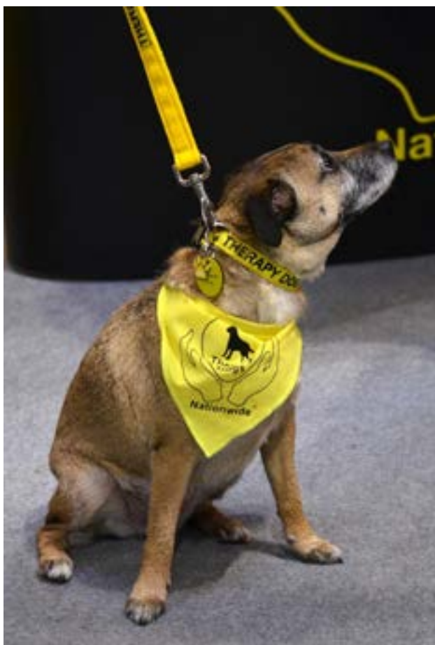
Left: Therapy dog, Sasha